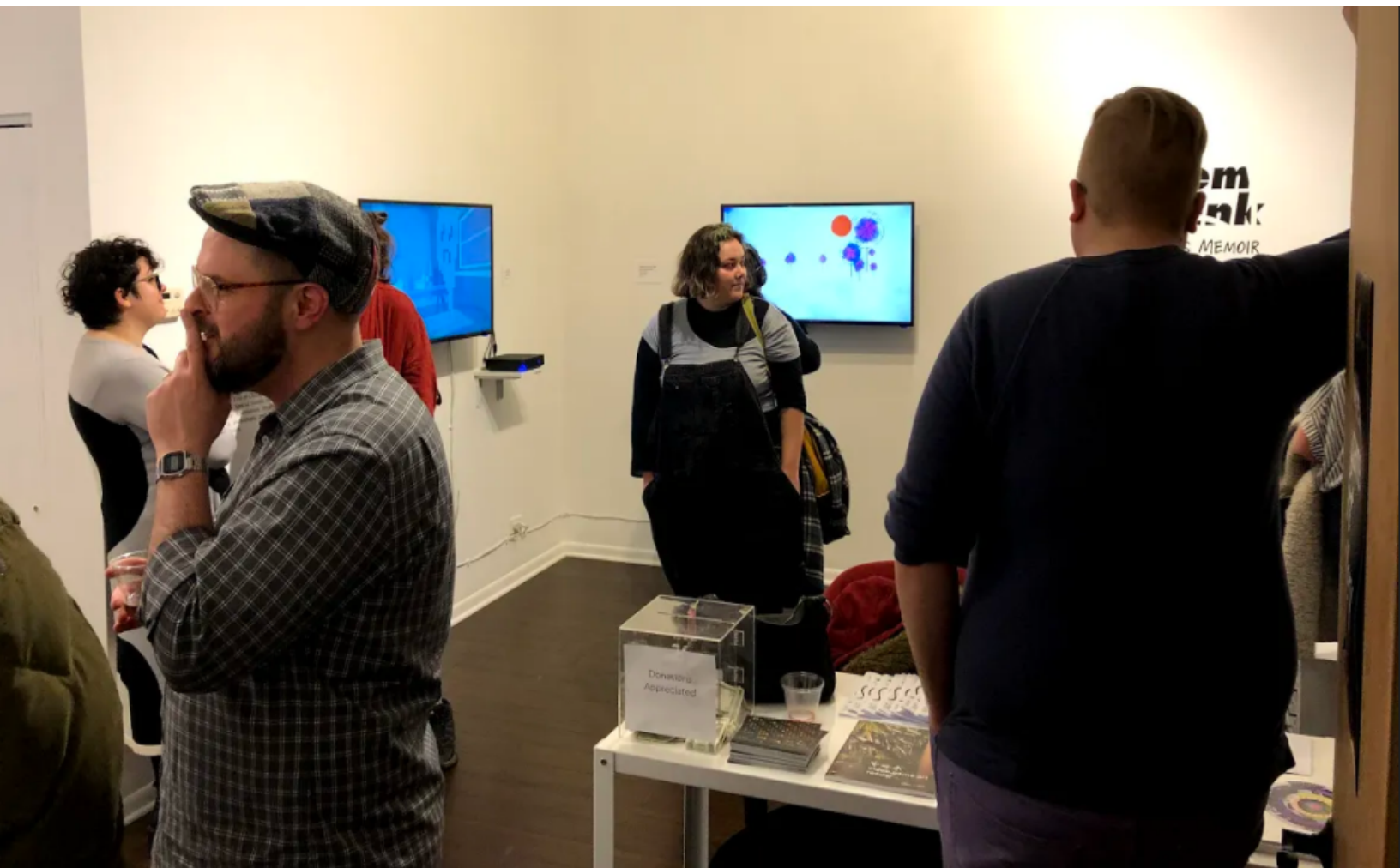
Opening Reception, System Link, January 24, 2020